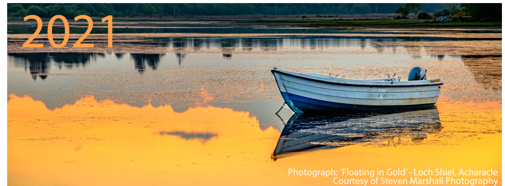
Photograph: 'Floating in Gold' - Loch Shiel, Acharacle